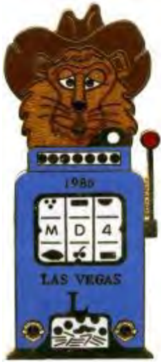
1985 Origin unknown