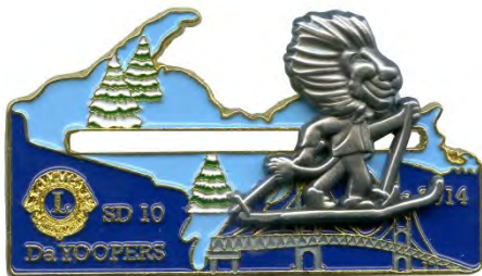
2014 Blue Sliding Pewter Lion

NOTE: The red, green, and blue sliding sleds with the Lion for 2013 are the regular issues and the purple, lime, and gray are special issues.