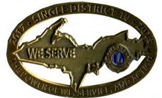
2018 Old Gold