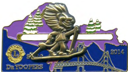
2014 Purple Sliding Old Gold Lion