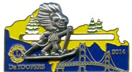
2014 Yellow Sliding Pewter Lion

NOTE: The blue, green, and red sliding Lions for 2014 are the regular issues and the purple, white, and yellow are special issues.