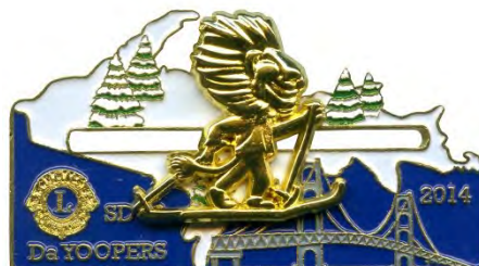
2014 White Sliding Bright Gold Lion