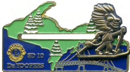
2014 Green Sliding Old Gold Lion