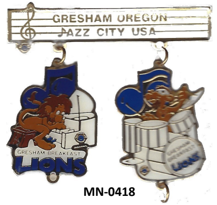
MN-0418 GRESHAM JAZZ CITY USA