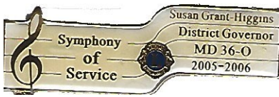
MN-0358 SYMPHONY OF SERVICE 2006