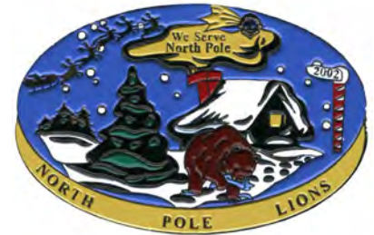
2002 North Pole Lions SA 0387