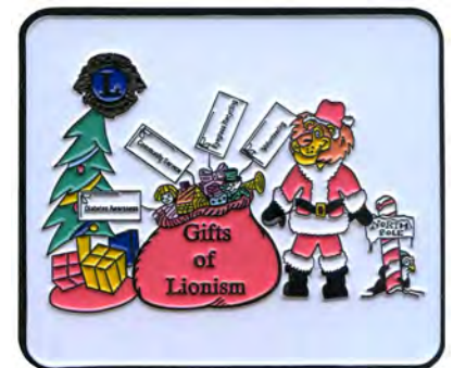
North Pole Lions Gifts of Lionism SA 0334