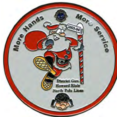
2002 Howard Rixie North Pole Lions SA 0330