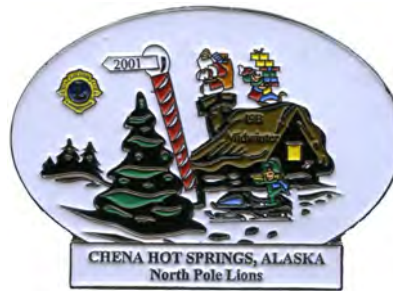
2001 North Pole Lions Santa Going Down the Chimney SA 0812