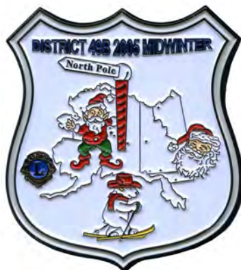
2005 District 49B SA 0332