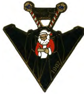
1997 North Pole Lions Blue Background Santa & His Notes SA 0698