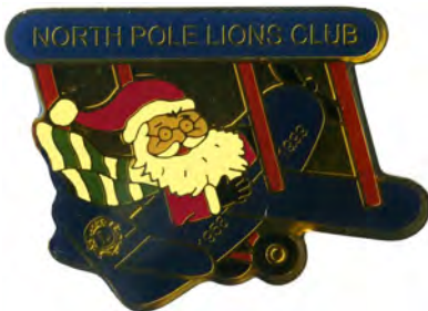
1999 North Pole Lions Santa & His Bi-Wing Airplane SA 1011