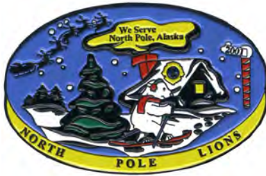
2001 North Pole Lions SA 0327