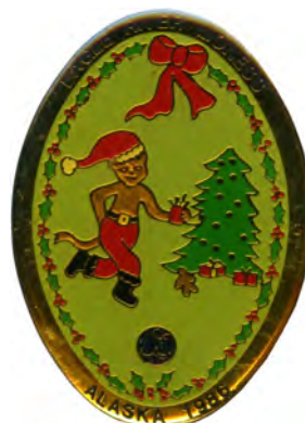
1986 Eagle River Lioness Merry Christmas SA 0831