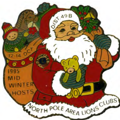
1995 North Pole Lions Mid-Winter Hosts Santa & His Toy Bag SA 0813