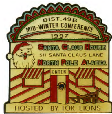
1997 North Pole Lions Mid-Winter Conference SA 0815