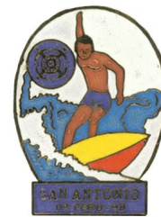
Unknown Date 003