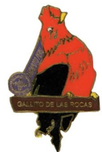
Unknown Date 004