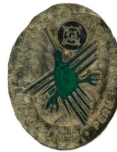
Unknown Date 001