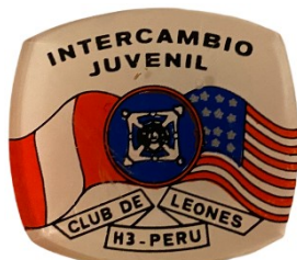
Unknown Date 005

Updated 06/19/2021: Added the 1987-1, 1987-2, 1993-2, 1996 and unknown date 005