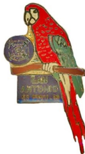
Unknown Date 002