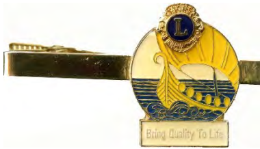
1986 Tie Clasp