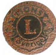
2023 Special 70 Years of Lions