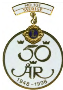
1998 Special 50 Years of Lions