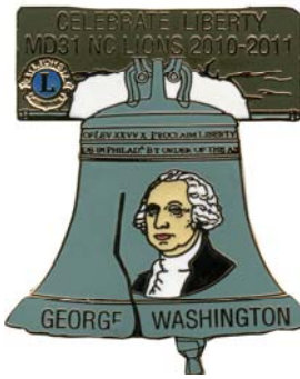
2011 George Washington