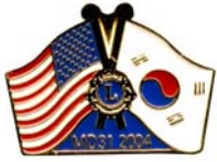
2004 State Convention Pin