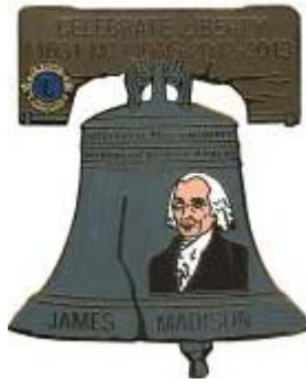
2013 James Madison