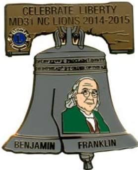
2015 Benjamin Franklin