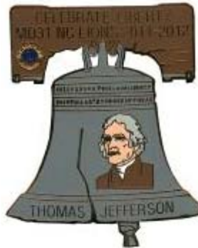
2012 Thomas Jefferson