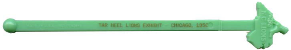
1950 "Tar Heel Lions Exhibit - Chicago 1950" Beverage Stirrer