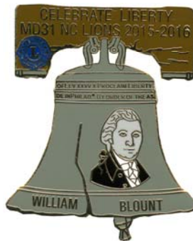
2016 William Blount