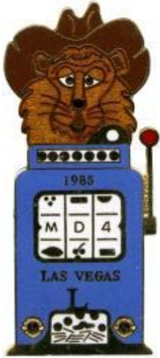
1985 Origin unknown