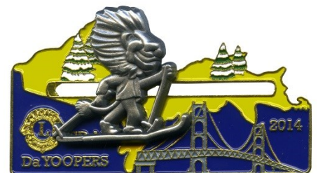
2014 Yellow Sliding Pewter Lion

NOTE: The blue, green, and red sliding Lions for 2014 are the regular issues and the purple, white, and yellow are special issues.