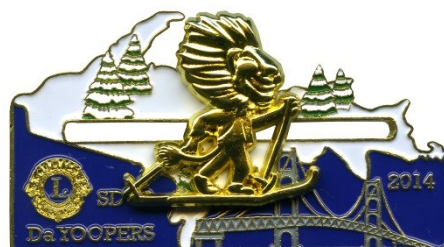
2014 White Sliding Bright Gold Lion