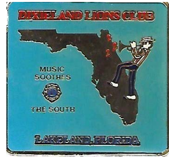
MN-0257 DIXIELAND LIONS