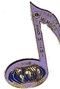
MN-0260 CHARTER MEMBER LIONS WORLD CHORUS MIAMI 1989