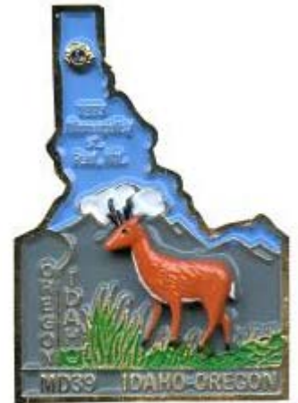
1993 P V