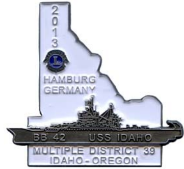
2013 Special White