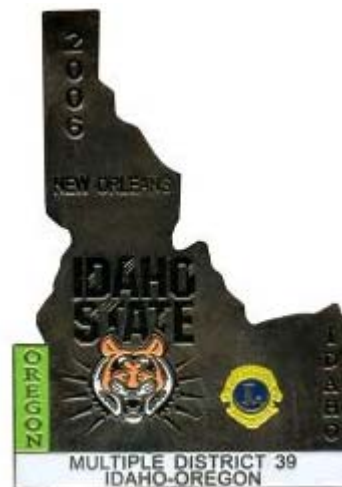
2006 P V Silver Yellow Emblem