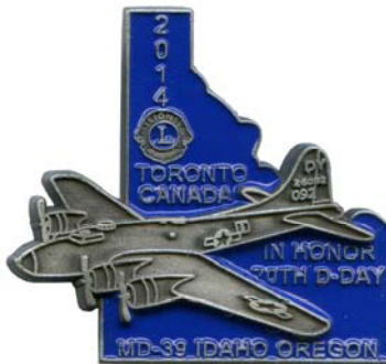
2014 P Blue