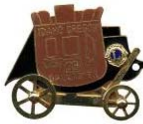
1975 Small Post Back