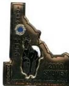
2010 P Silver