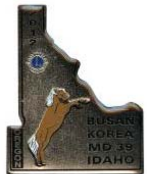
2012 P Silver