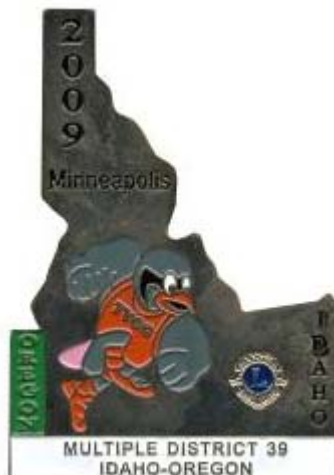
2009 P Silver