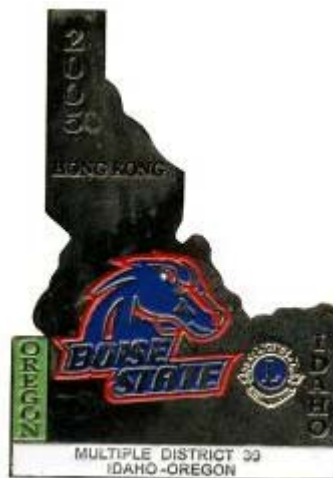
2005 P Silver