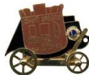
1975 V Small Safety Pin Back