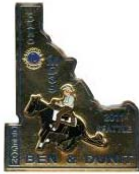
2011 P Silver