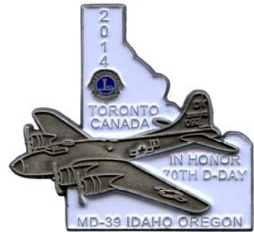
2014 Special White