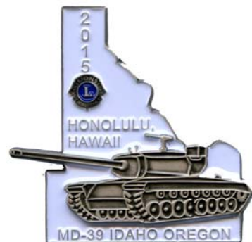
2015 Special White