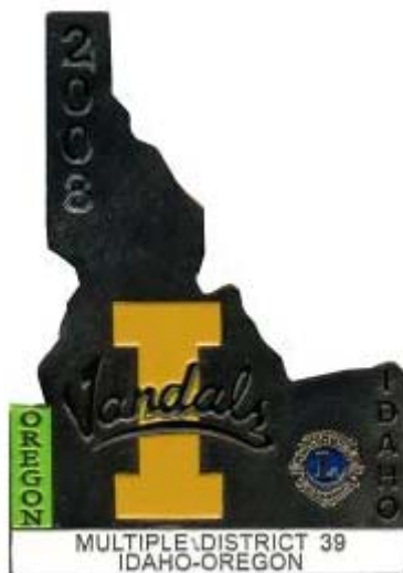
2008 P Silver