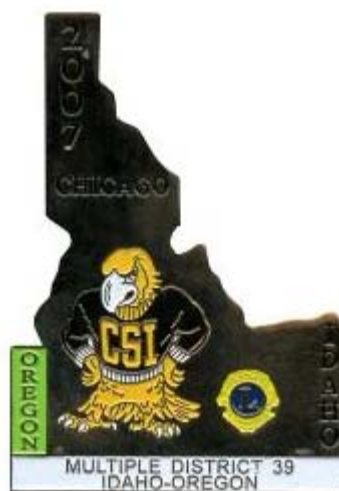
2007 P Silver