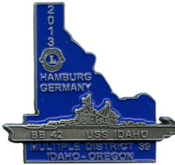
2013 P Blue