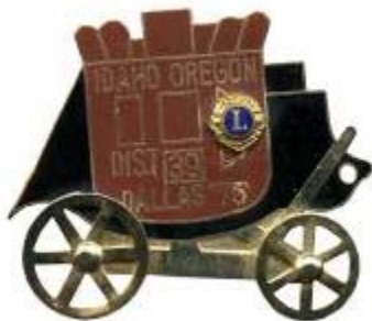
1975 V "District 39" is Larger