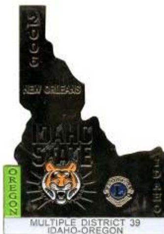
2006 P Silver