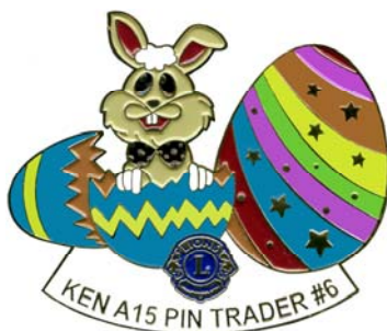
HS 1729 16 Ken Strauss (CAN) Easter Bunny Out of the Egg #6