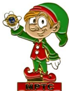
HS 1732 16 Red Base