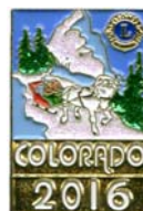
HS 1751 16 MD-6 Colorado Santa & His One Horse Sleigh Mini Pin