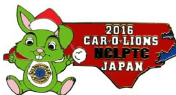
HS 1742 16 Dale Dupree (NC)