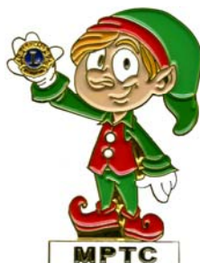
HS 1737 16 White Base