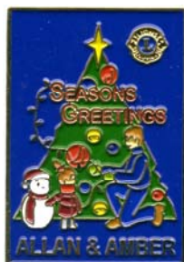
HS 1707 16 Allan & Amber Wilson (CAN) Seasons Greetings Dark Purple