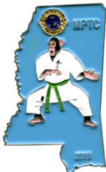
HS 1723 16 Green Belt