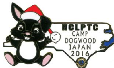
HS 1740 16 2016 Pin Swap