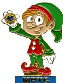
HS 1733 16 Blue Base