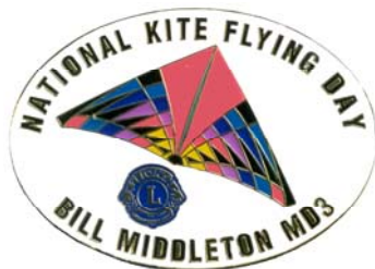
HS 1714 16 Bill Middleton (OK) National Kite Flying Day

NOTE: The three pins above, as the titles imply, all have spinners.