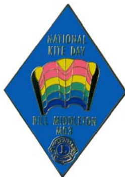
HS 1715 16 Bill Middleton (OK) National Kite Day