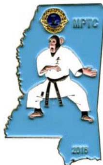
HS 1727 16 Black Belt