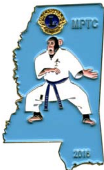
HS 1724 16 Blue Belt