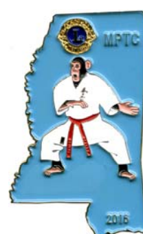
HS 1726 16 Red Belt