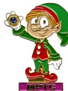
HS 1735 16 Purple Base