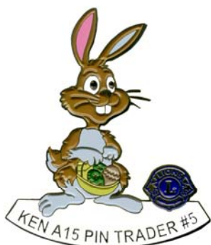
HS 1728 16 Ken Strauss (CAN) Greetings from the Easter Bunny #5