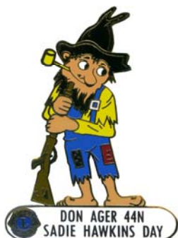
HS 1746 16 "Pa" Ager (NH)