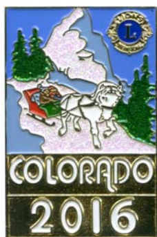
HS 1750 16 MD-6 Colorado Santa & His One Horse Sleigh