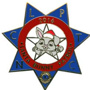
HS 1739 16 2016 Breakfast