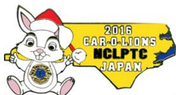
HS 1741 16 Gene English (NC)