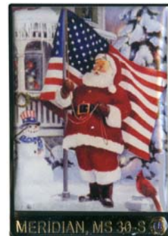
HS 1721 16 Meridian Lions Club (MS) Santa and the American Flag

NOTE: The McCaulley pins on this page will be available at the NC Swap