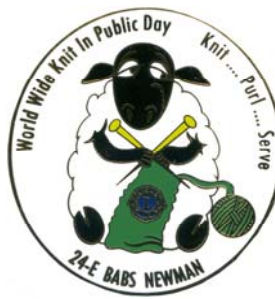
HS 1730 16 Babs Newman (VA) World Wide Knit in Public Day Sheep With Green Yarn