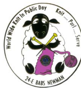
HS 1731 16 Babs Newman (VA) World Wide Knit in Public Day Sheep With Purple Yarn