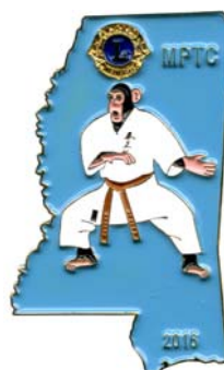
HS 1725 16 Brown Belt