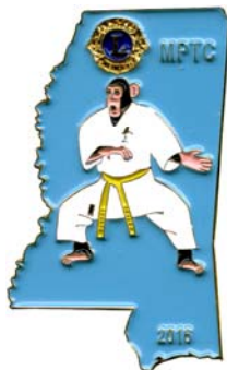
HS 1722 16 Yellow Belt

NOTE: The McCaulley pins on this page will be available at the NC Swap