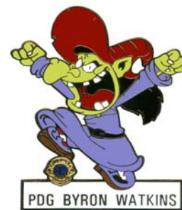
HS 1710 16 Byron Watkins (KY) Angry Halloween Witch #5