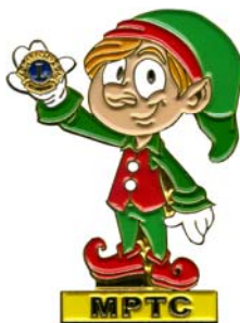
HS 1736 16 Yellow Base