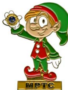
HS 1734 16 Gold Base