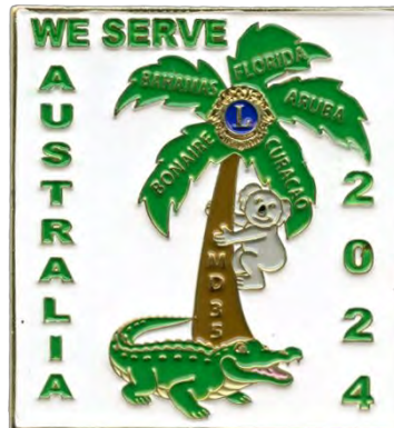
2024 Florida Prestige