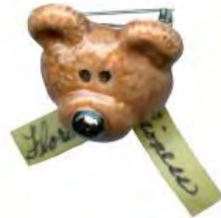
Florida Lioness Unknown Date