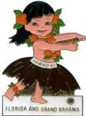
1983 V-2 Color