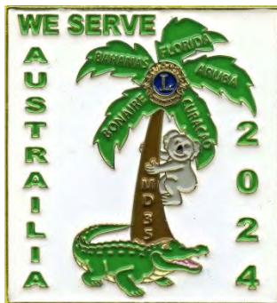
2024 Florida Variation Spelling