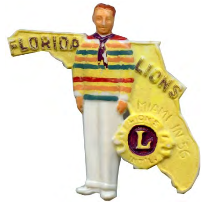
1956-1 V (Color)