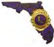
1965 - 1 V