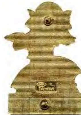
1983 V-1 & V-2