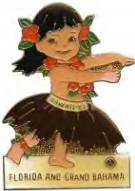
1983 V-1 Color