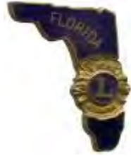
1964 - 1