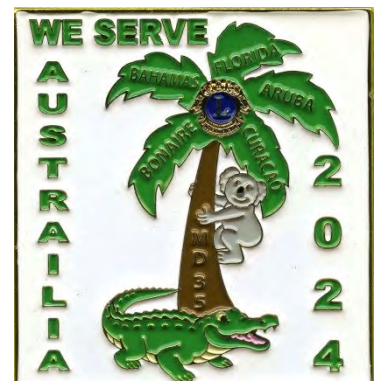
2024 Florida Prestige Variation Spelling