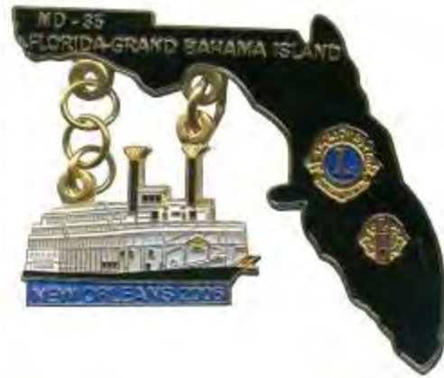
2006 New Orleans