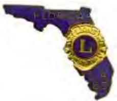
1965 - 1