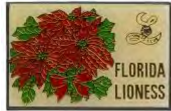
Florida Lioness Unknown Date