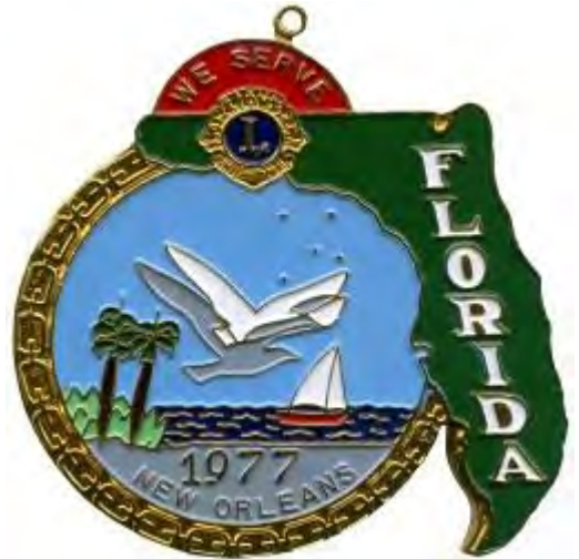
1977-1 Gold Medallion

NOTE: 1977 has various shades of blue sky.