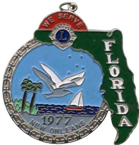
1977-2 Silver Medallion