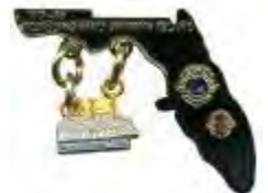
2006 New Orleans