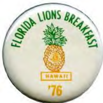
1976 Breakfast Button