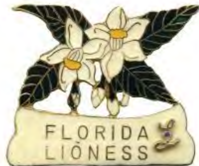
Florida Lioness Date Unknown