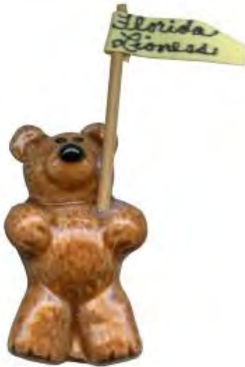
Florida Lioness Unknown Date