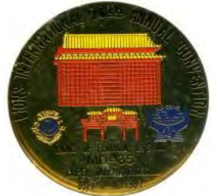
1987 Special - 1